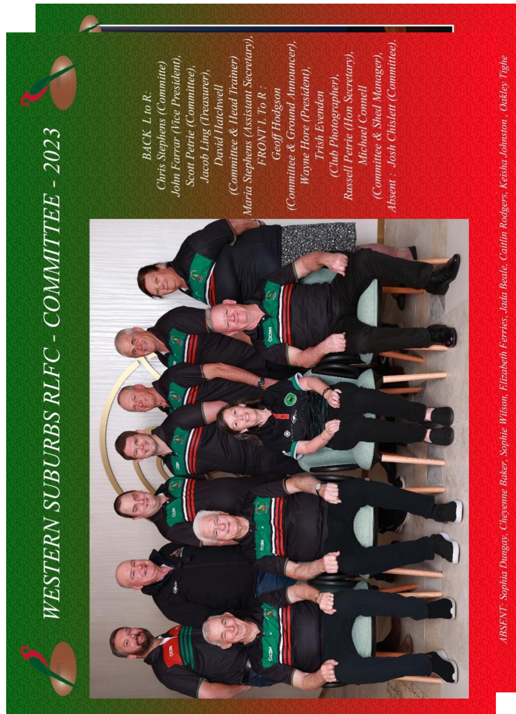
WSRLFC Committee 2023